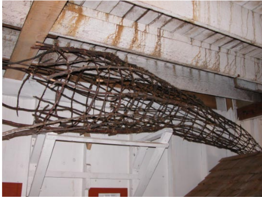
Fish trap used by natives