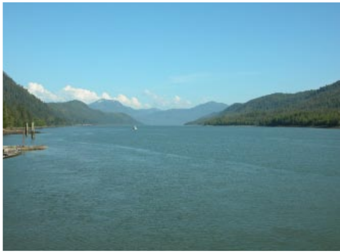
the Skeena River