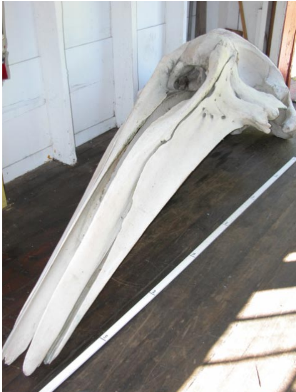
7' Whale skull