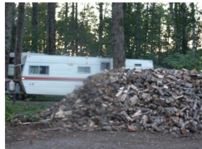
Somebody's worked out a lot of frustration on that woodpile!