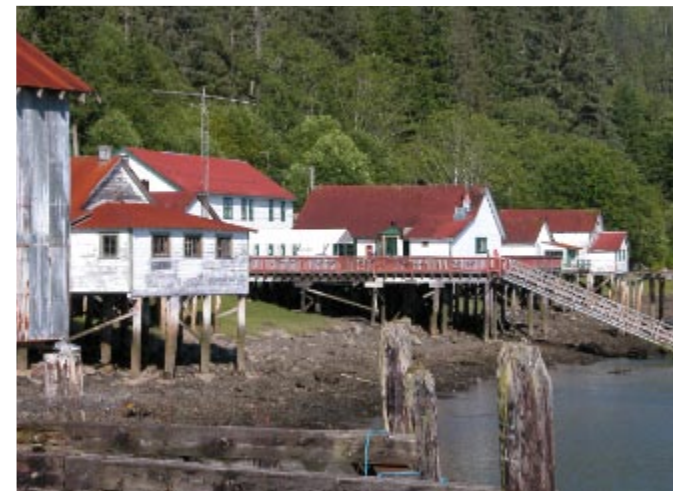
The cannery village