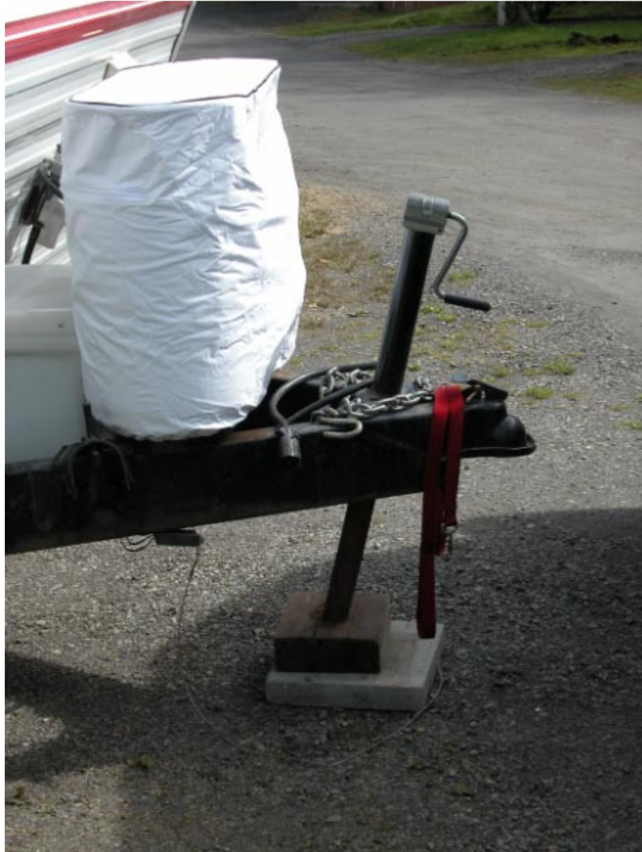
A jaunty angle