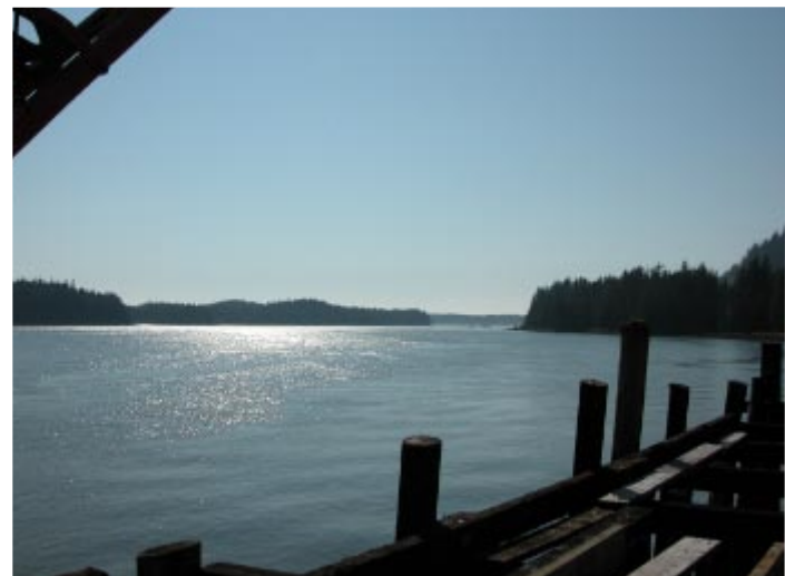
Skeena River from the fish cannery