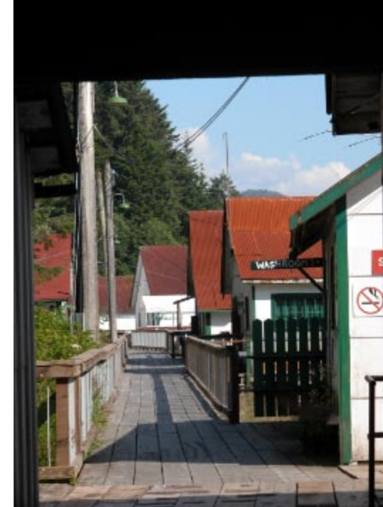
The cannery village