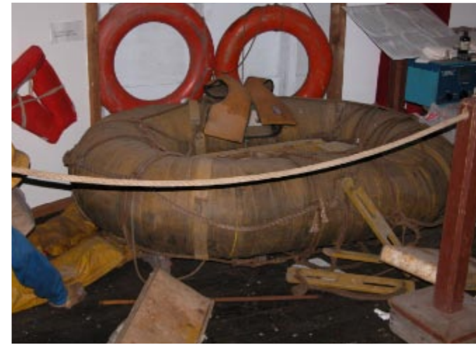
A not-so-modern life raft